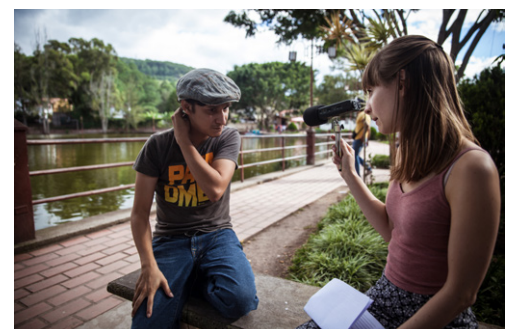
LAB offers interview training and production of podcasts